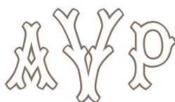
Three letter monogram

Type any lowercase + Capital + lowercase