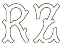
Two letter monogram

The outline version of Tagliato Monogram requires the Stylistic Alternates feature, available in most OpenType savvy applications, such as Adobe Illustrator CS (see Fig. 1). You can enable Stylistic Alternates and type out a monogram or text, or you can highlight an already setup solid monogram or text and enable Stylistic Alternates to change it to the outline style.