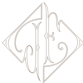
Type any Capital & Lowercase letters with Stylistic Alternates enabled

The outline version of Diamant Monogram requires the Stylistic Alternates feature, available in most OpenType savvy applications, such as Adobe Illustrator CS (see Fig. 1). You can enable Stylistic Alternates and type out a two letter monogram, or you can highlight an already setup solid monogram and enable Stylistic Alternates to change it to the outline style.