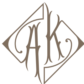
Or with OpenType ligatures enabled you can type any two Capital or Lowercase letters